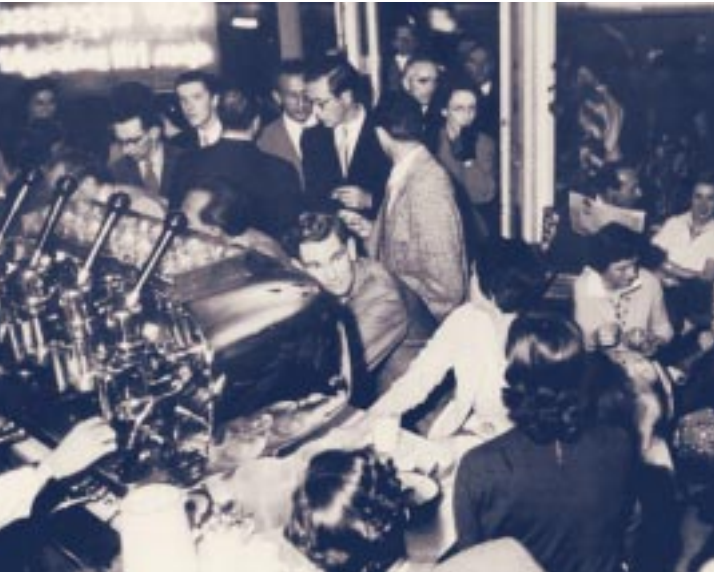
The inauguration of the Mokamba coffee bar, Knightsbridge, London 1954.