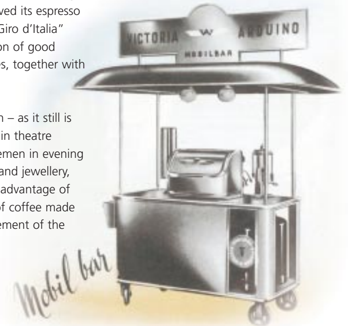
Mobil bar 1960.

In those moments the smooth surface of the machine, lightly faceted with hammer strokes, reflected the thousand kaleidoscopic forms of aristocratic female faces and smart male profiles that rose and fell in substance, governed by the multiform play of reflections that accompanied smiles and mischievous glances.