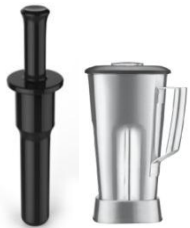
Kuvings Power Blender