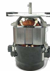
MOTOR - 9538B

220~240V, 50~60Hz 1500W (2HP, max 5HP) 4.2kg 32,000RPM