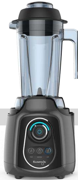
Kuvings Power Blender