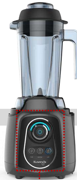
Kuvings Power Blender