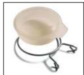
Proximity condenser air filter