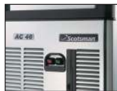
Front ON-OFF Switch